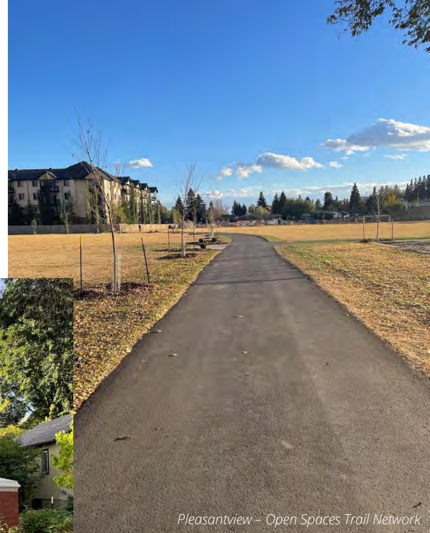
Pleasantview – Open Spaces Trail Network