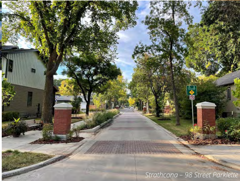
Strathcona – 98 Street Parklette